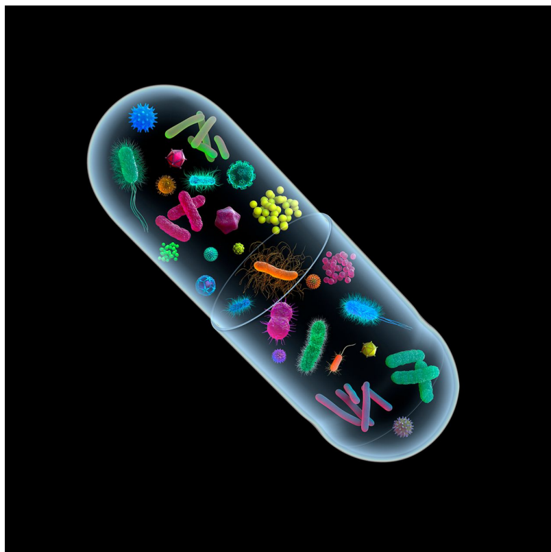
ILLUSTRATION: OLIVER BURSTON