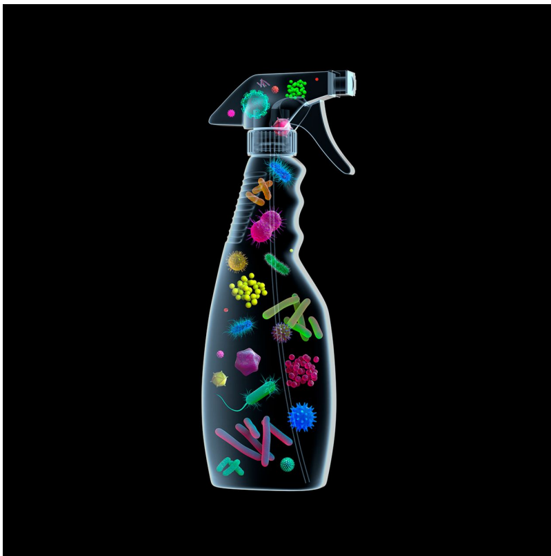
ILLUSTRATION: OLIVER BURSTON

Dr. Blaser’s lab is studying what happens when it restores microbes in mice that have been treated with antibiotics by feeding them feces from mice who haven’t received antibiotics. They are finding that this treatment can help with restoring those microbes, he says.