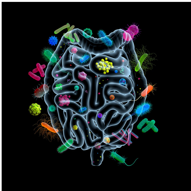
ILLUSTRATION: OLIVER BURSTON

learning algorithm that could predict an individual's glucose response after eating, based on features like blood work, dietary habits, body measurements and gut microbiome profile. Based on those results, they set up personalized diets for 26 prediabetic people, who saw significantly lower blood glucose spikes on the diets than before, which could help decrease the risk of developing diabetes. The lab is now carrying out a larger, yearlong, randomized control trial of 100 prediabetic people on personalized diets and 100 prediabetic people on a standard diet recommended by the American Diabetes Association. Eventually, "we could try to utilize personalized nutrition not just for glucose management, but maybe also to control other microbiome-associated diseases, inflammatory diseases and other diseases," Dr. Elinav says.